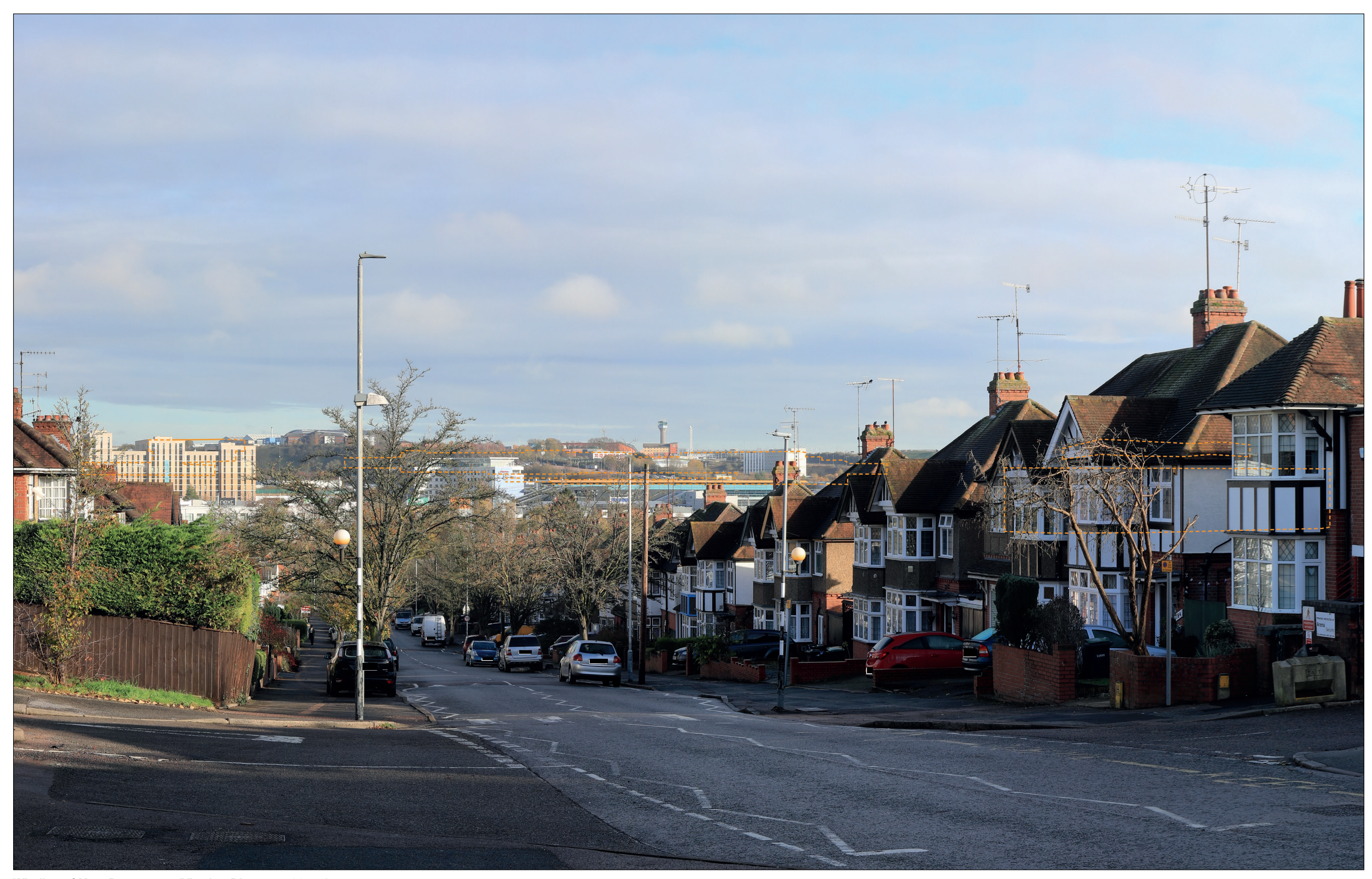
Wireline of Max. Parameters (Viewing Distance 500mm)