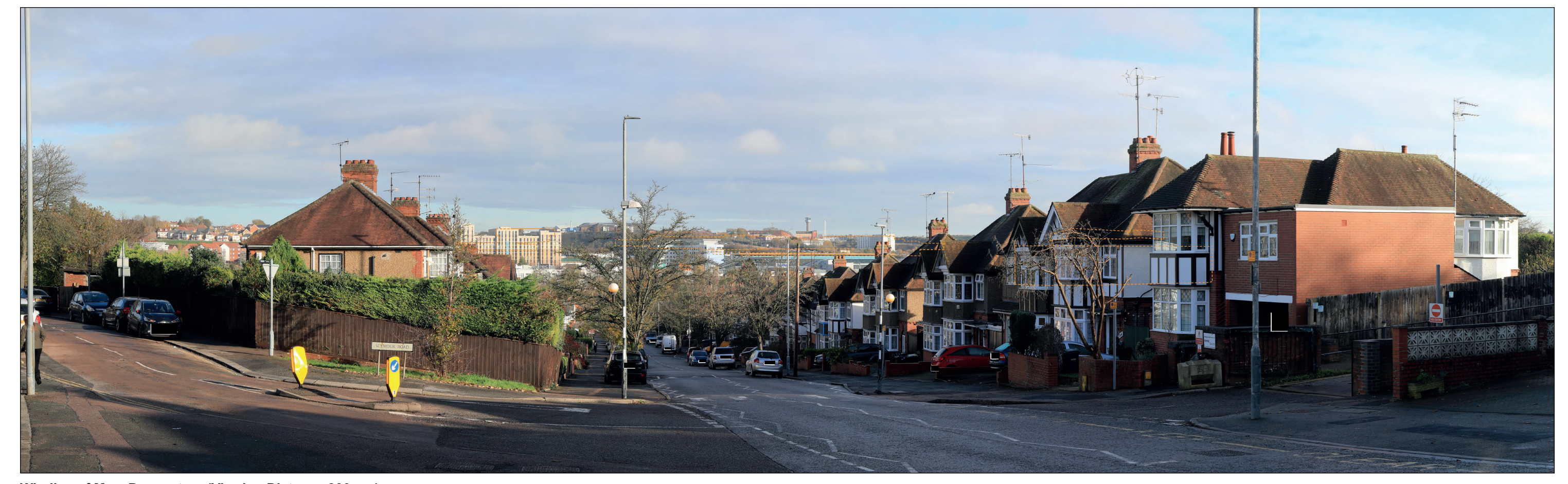
Wireline of Max. Parameters (Viewing Distance 300mm)