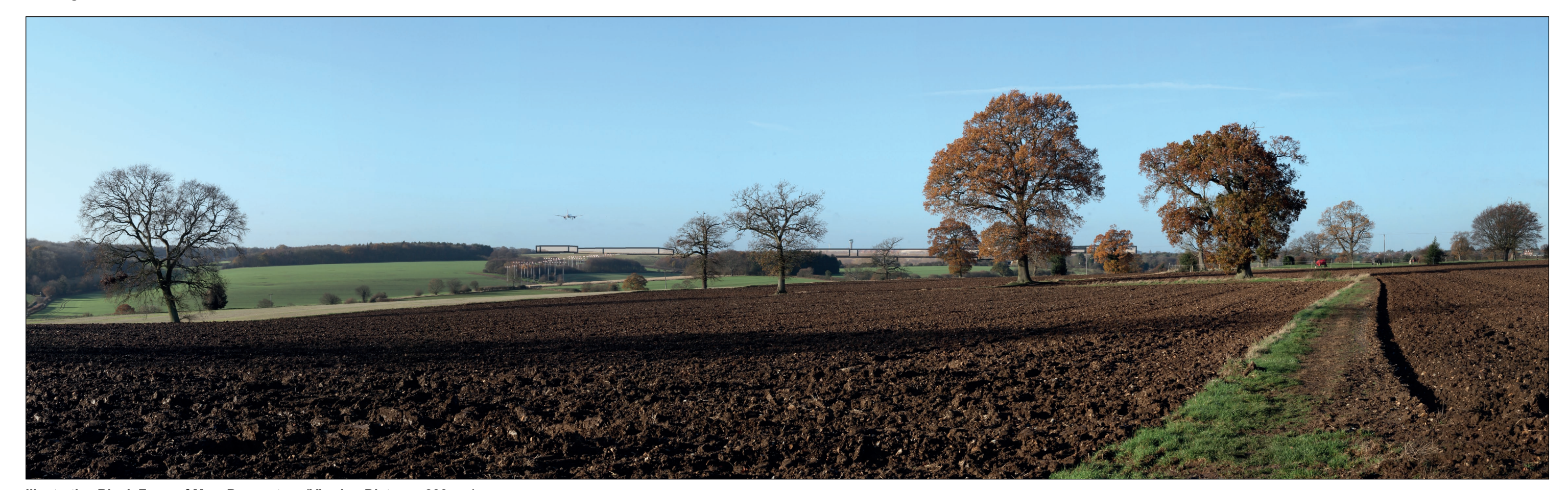
Illustrative Block Form of Max. Parameters (Viewing Distance 300mm)